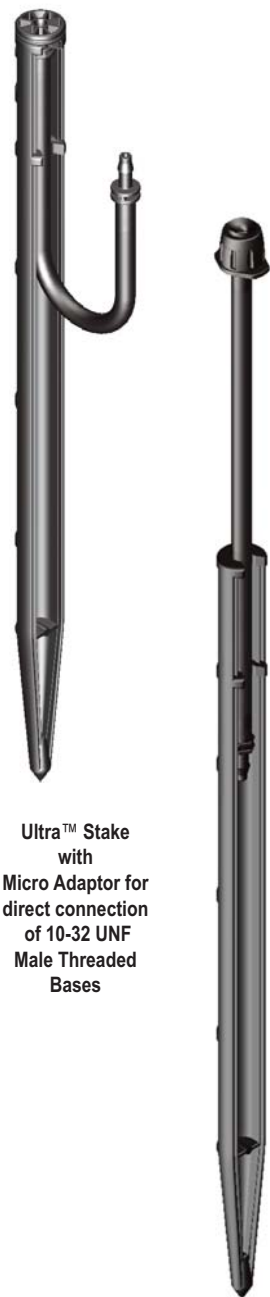
Ultra™ Stake with Micro Adaptor for direct connection of 10-32 UNF Male Threaded Bases